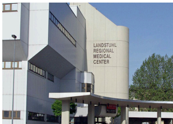
Landstuhl Regional Medical Center