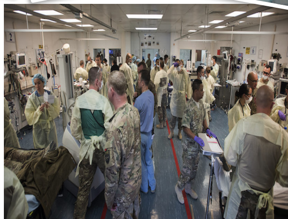
Craig Joint Theater Hospital Trauma Bay