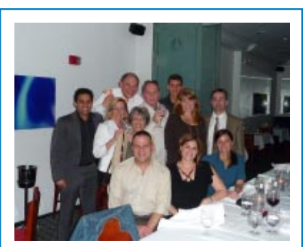
GSACEP scholarship winners, and leadership, at LAC dinner together

major topic in today's legislative push, especially considering the new (2010) health care bill. There is a myriad of information that is on the internet which can help us to understand the issues. Also, there are many resources which we found extremely helpful.