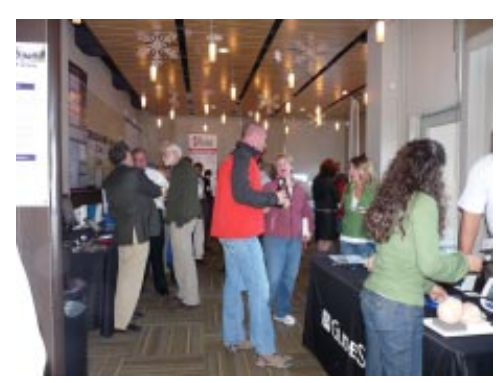
Guests at the reception