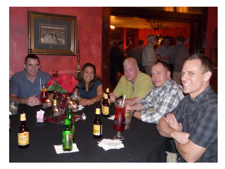
Opening reception GSS 2011 was held at Pat O'Brien's