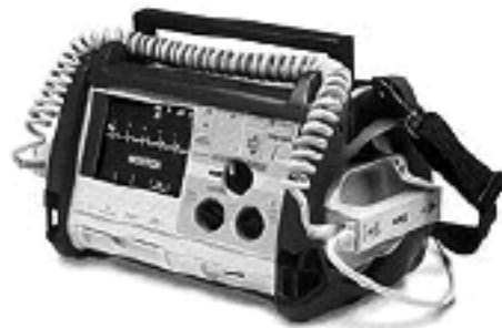
ZOLL M Series Basic with Xtreme Pack™ jacket and paddles

Superior technology that's changing cardiac care